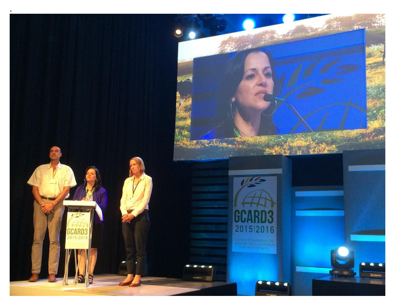
GFAR Secretariat & YPARD session facilitators set out the aims of the new Alliance at GCARD3

In GCARD3 2016, Foresight was one of the key themes explored in depth by participants. During the Conference, the Partners in GFAR, in particular farmer's organizations and regional fora from around the world, together developed the frame for a new Alliance for the re-appropriation of rural futures. The Alliance will bring together local innovation with that from science and work to bring smallholder farmers directly into the process of exploring their own desired futures, by which to inform and participate in current research and innovation processes, in order to achieve those desired futures. This Alliance has now been established into practice among a range of partners from across all sectors.