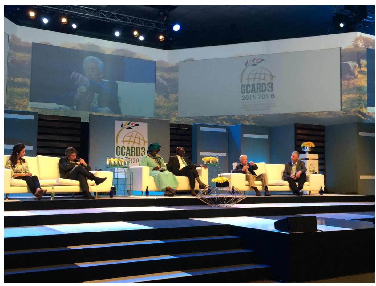
Plenary Panel Session of GCARD3, senior representatives of EC, CGIAR, IFAD, Farmers, and CSOs

The breakdown of current partners already shows an encouraging spread of active participation across all sectors. The number of self-declared Partners continues to grow rapidly. In some cases where there are strong networks, individual organizations may have so far preferred to be represented through their network organization. The term civil society organizations covers many rural development organizations at scales ranging from the community to global networks. All of the CGIAR and AIRCA Centres have expressed themselves as Partners in GFAR. Representation of the private sector is now also strong, with all the main international agriculture and food industry networks now involved, as well as many smaller companies.