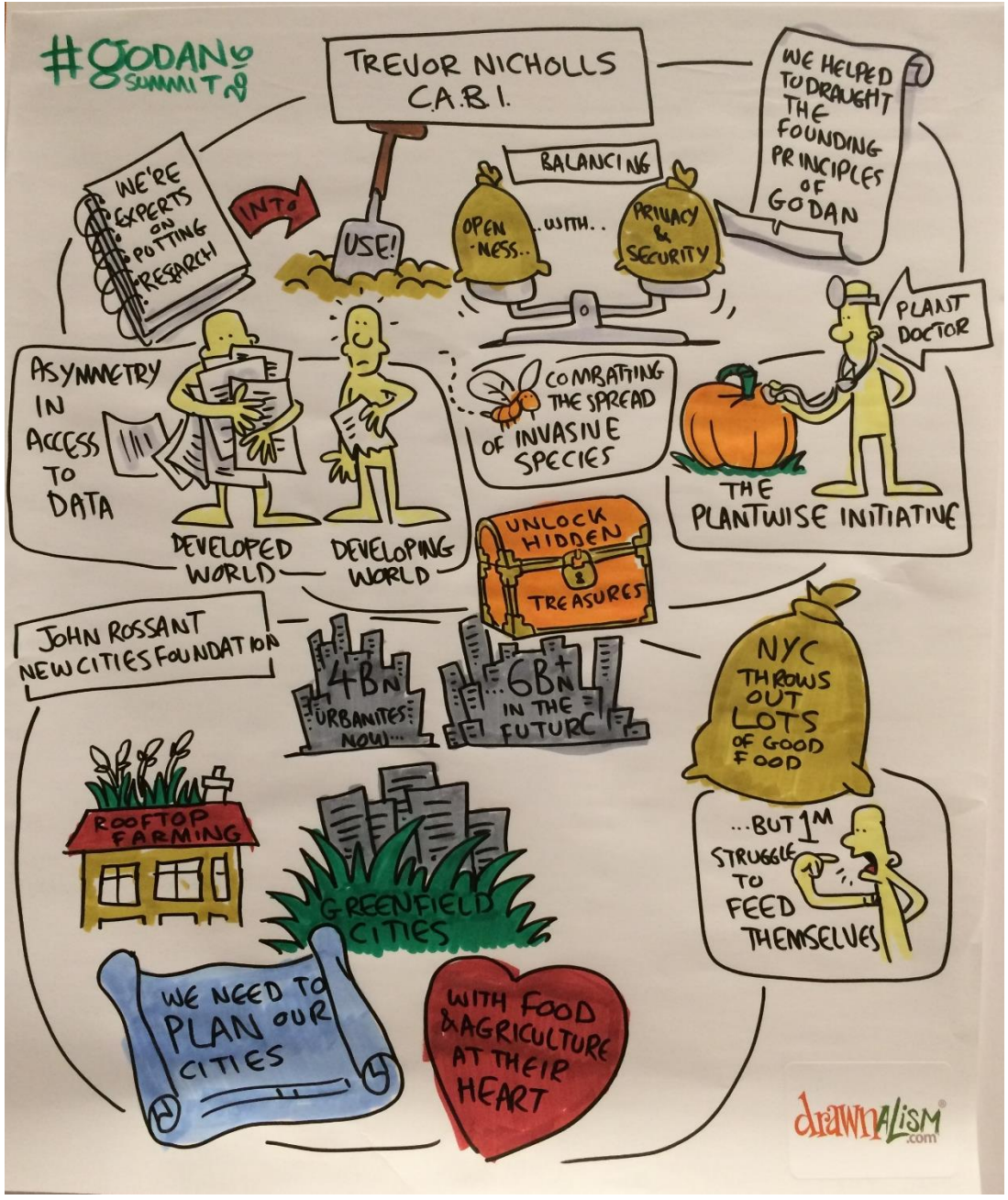
Pictorial summary of GODAN Summit discussions

GFAR Secretariat also organised and participated in Agrifutures Days International Conference organized by Club of Ossiach at Villach, Austria, including a Keynote Address on Role of ICTs in Developing Rural-Urban Continuums and Chairing the Conference session on "Role of ICTs in Sustainable Development of Rural-Urban Continuums. The Club of Ossiach is now developing proposals for E-Learning Modern Agriculture for Refugees and Migrants from Africa who have entered Europe, and also an Integrated Platform for Agricultural Information using GIS, for use in West Africa, East Africa and India.